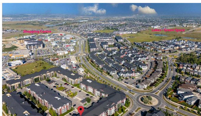
1426-81 Legacy Blvd SE, Calgary, AB