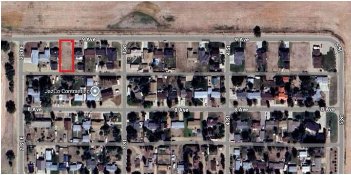
Town of Bassano Vacant Property Listing Details

BEAUTIFUL BASSANO - Welcome to an incredible opportunity to build your dream home in vibrant Bassano for only $5,000! This prime lot has all town services conveniently run to the property line, ready for your vision. Enjoy Bassano's charming community with an outdoor pool, local arena, parks, and a revitalized downtown. Buyers must submit a development permit application within 6 months of signing for a taxable improvement per LUB 921/21. There is also a build timeline requirement. Allowed property types include Prefab Homes and Stick Build. Mobile homes are NOT allowed. Call now to get more information as we have multiple lots available!