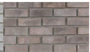
Selkirk - Contemporary Brick Brownstone