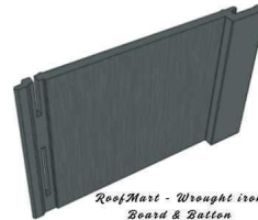
RoofMart - Wrought iron Board & Battan