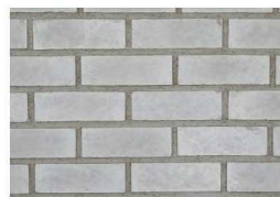
Selkirk - Contemporary Brick Bisque