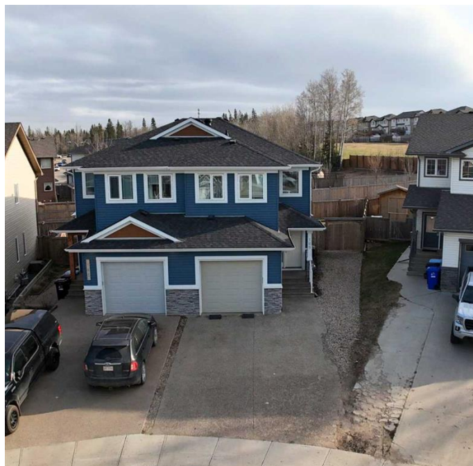
169 Shalestone Way, Fort McMurray, AB

Upstairs, youâ€™ll find TWO primary bedrooms, each with its own ensuite! The main bathroom is a 4-piece ensuite for the second bedroom. Amazing dual function and perfect for guests or a growing family. There is a third bedroom upstairs, also great for