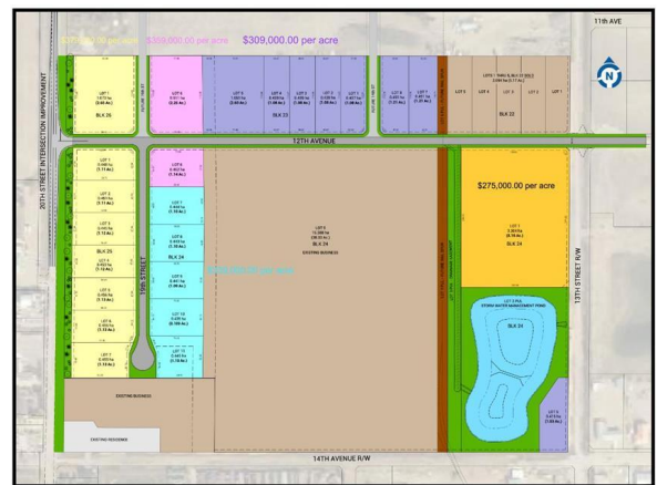
845 DEVELOPMENT INDUSTRIAL SUBDIVISION